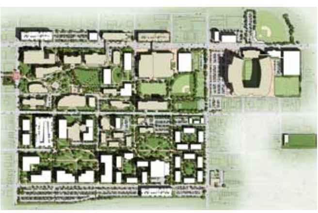
ILLUSTRATIVE CAMPUS PLAN