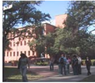
COWLES LIFE SCIENCES BUILDING