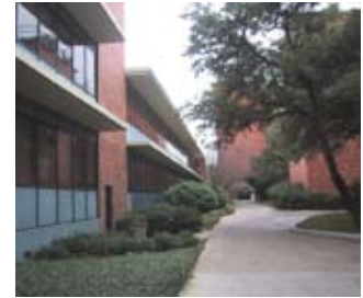
MARS McLEAN SCIENCE CENTER