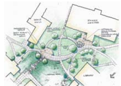
LANDSCAPE SKETCH CAROL R. JOHNSON ASSOCIATES