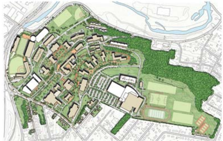
ILLUSTRATIVE PLAN 2007

Housing for up to 300 students will be built in both residence hall and apartment formats. The existing athletics complex will be expanded and renovated, and a football practice facility will be built near the existing stadium. The existing field house will be renovated for recreational activities. The Campus Plan reserves a site at the formal entrance to campus for a Performing and Fine Arts Center. With these improvements space can be reassigned to meet other academic and administrative facility needs.