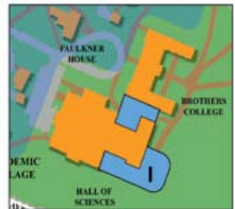
CONCEPT PLAN OPTIONS