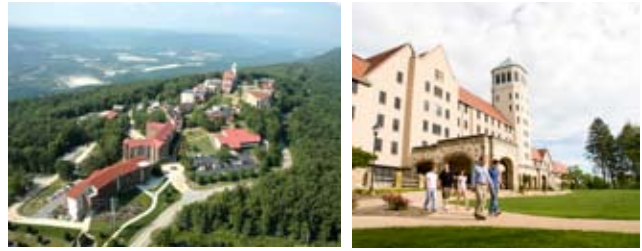
AERIAL VIEW / CARTER HALL

The College has hired an engineer to design the relocation of Scenic Highway and to provide data for discussions with the State — which to date have been positive. Once the road is relocated, the College intends to develop the Fine and Performing Arts Center. Covenant is also moving forward with a major renovation of their signature building, Carter Hall, as well as the construction of additional student housing.