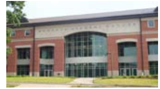
HENDRIX STUDENT CENTER