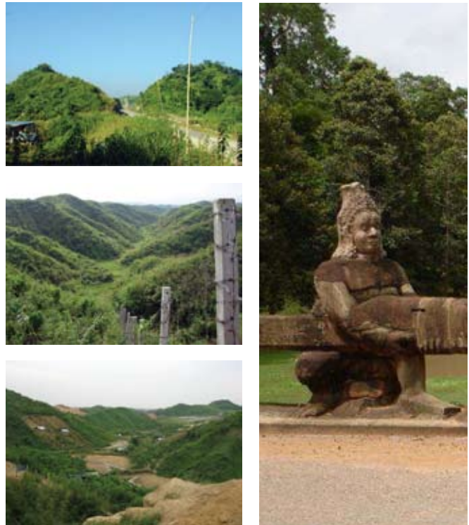
SITE LOCATION PHOTOS